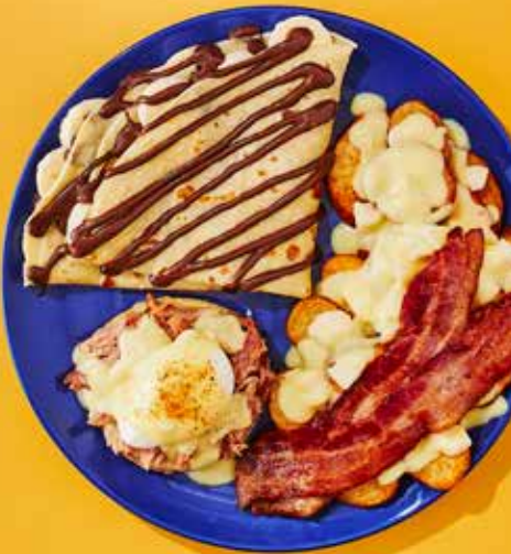
Poutine, benedict and crepe dilemma