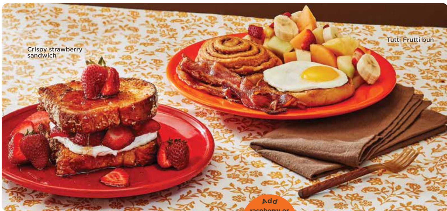
Crispy strawberry sandwich