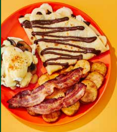
Benedict and crepe dilemma

Replace our homestyle potatoes with poutine $4.95