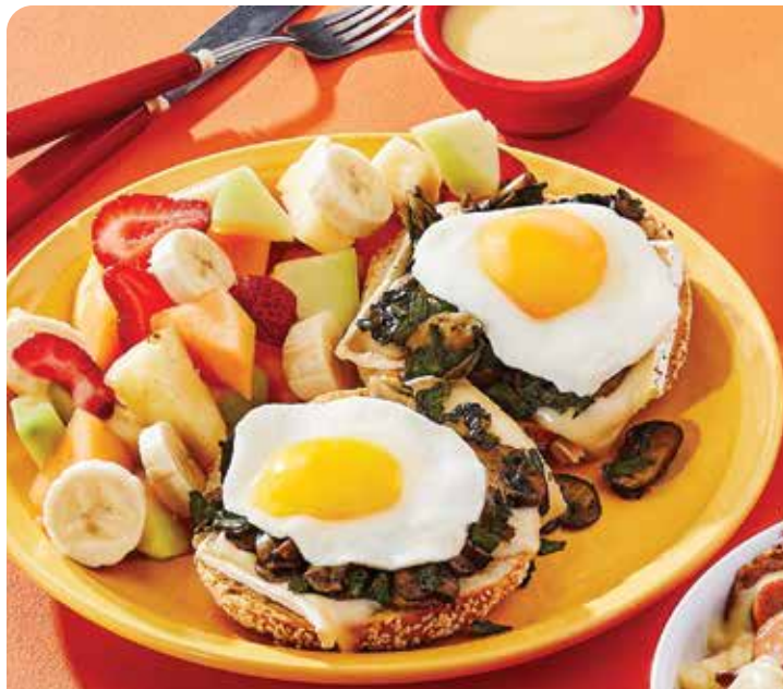
Mushroom and spinach bagel