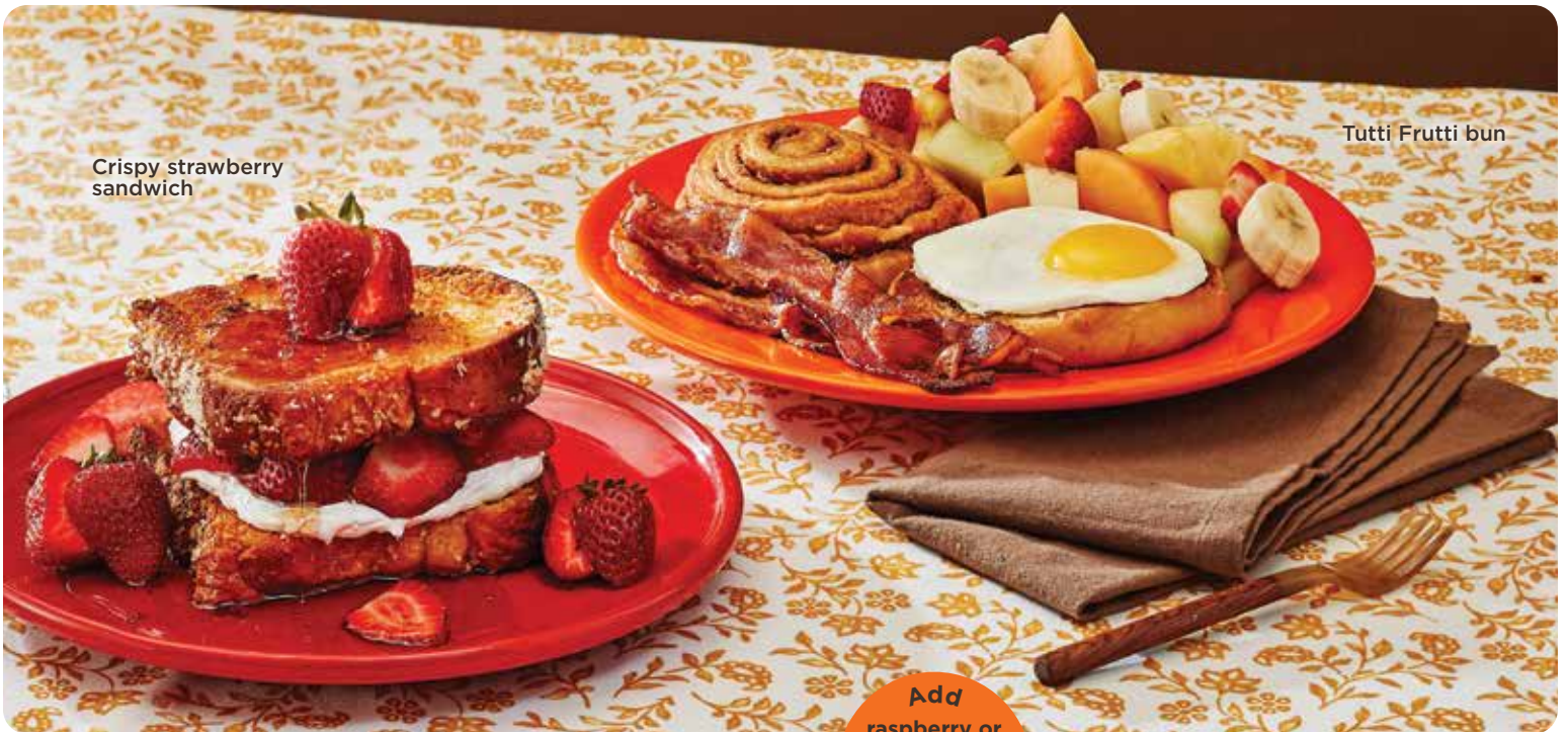
Crispy strawberry sandwich