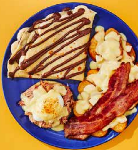
Poutine, benedict and crepe dilemma

A banana and NUTELLA® crepe paired with a shredded ham and cheddar Benedict, served with 2 bacon and a homestyle potato poutine made with cheese curds and Hollandaise sauce