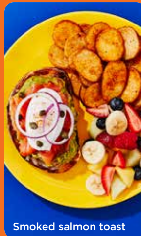
Smoked salmon toast

Smoked salmon N 17 95 Spicy sourdough bread, cheddar, guacamole, smoked salmon and poached egg, served with homestyle potatoes and fresh fruit