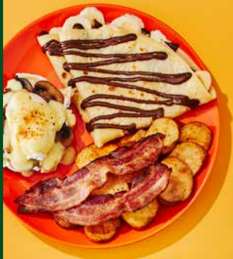
Benedict and crepe dilemma

Replace our homestyle potatoes with poutine $4.95