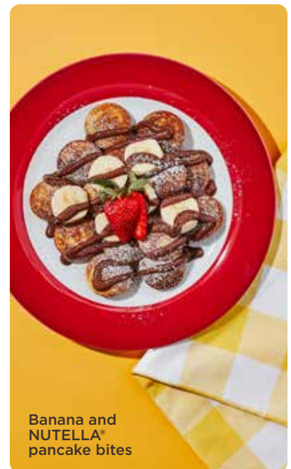
Banana and NUTELLA® pancake bites

Early Bird Special 20% off your main dish