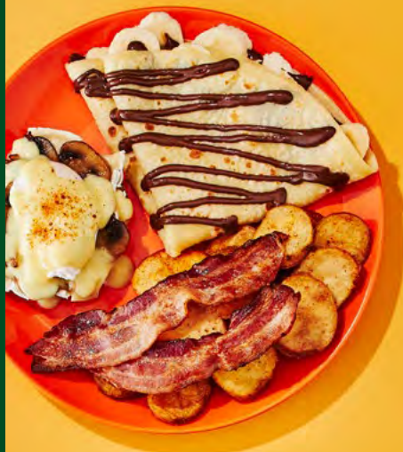
Benedict and crepe dilemma

Replace our homestyle potatoes with poutine $4.95