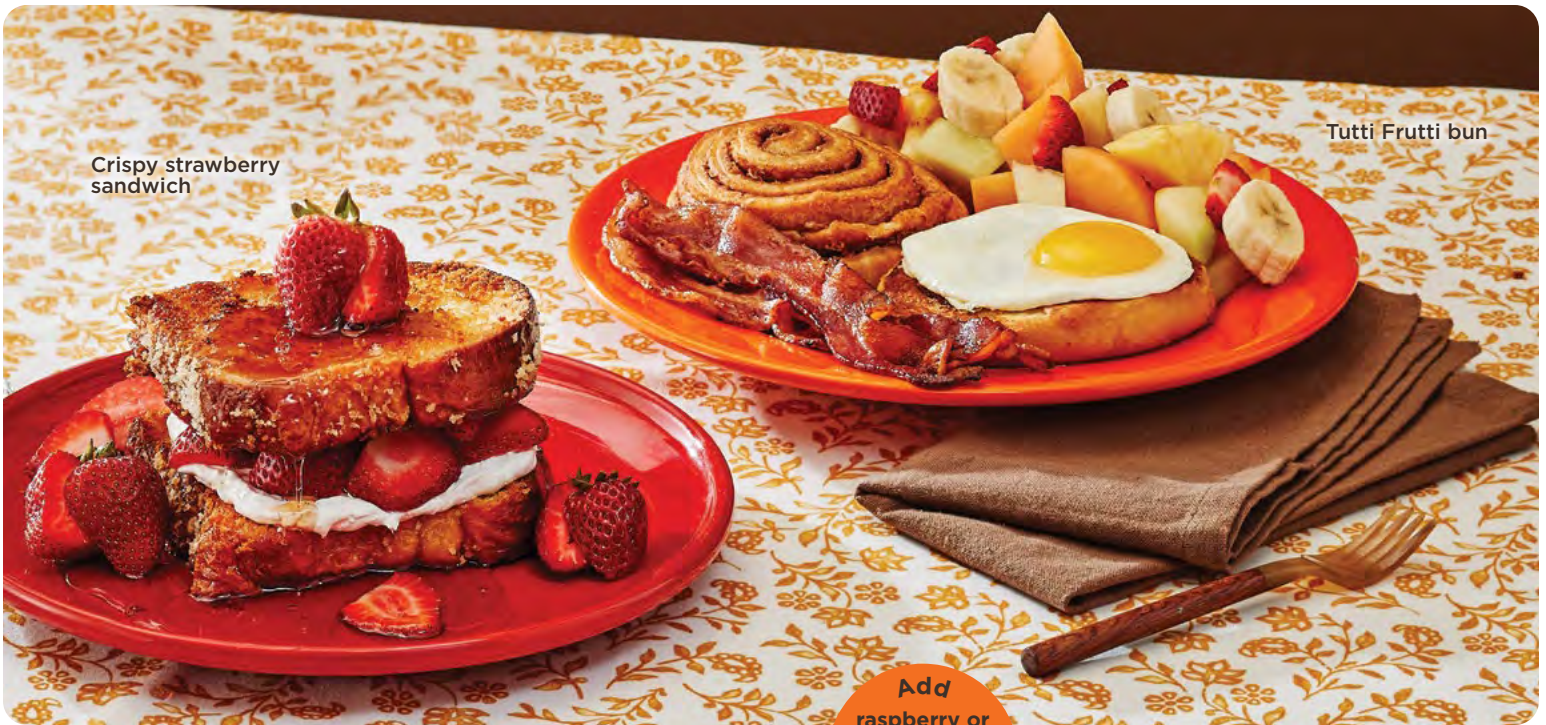
Crispy strawberry sandwich