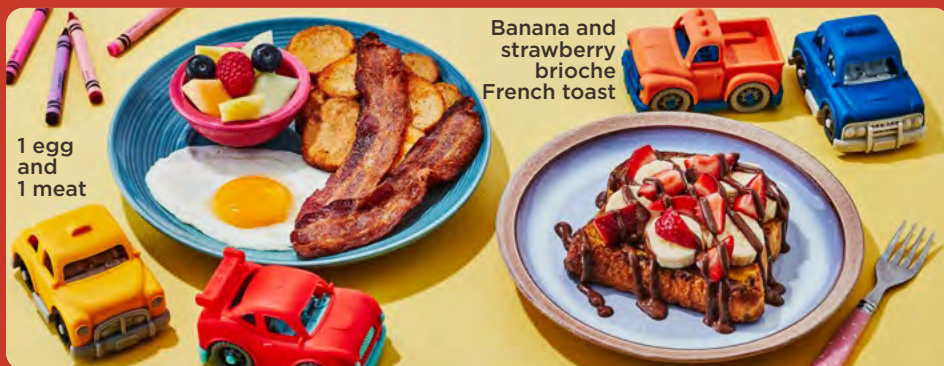
1 egg and 1 meat