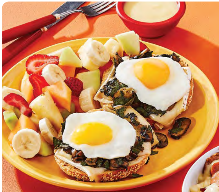
Mushroom and spinach bagel