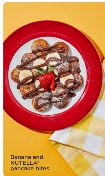
Banana and NUTELLA® pancake bites

Early Bird Special 20% off your main dish