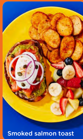
Smoked salmon toast

Smoked salmon N 17 95 Spicy sourdough bread, cheddar, guacamole, smoked salmon and poached egg, served with homestyle potatoes and fresh fruit