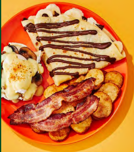
Benedict and crepe dilemma

Replace our homestyle potatoes with poutine $4.95