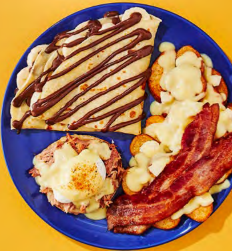
Poutine, benedict and crepe dilemma