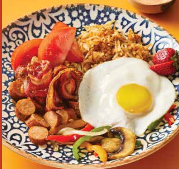
Bacon and sausage Breakfast bowl