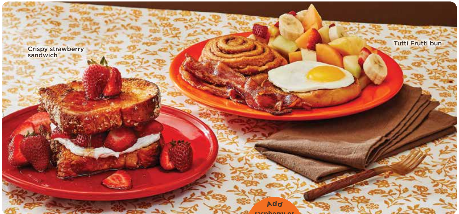
Crispy strawberry sandwich