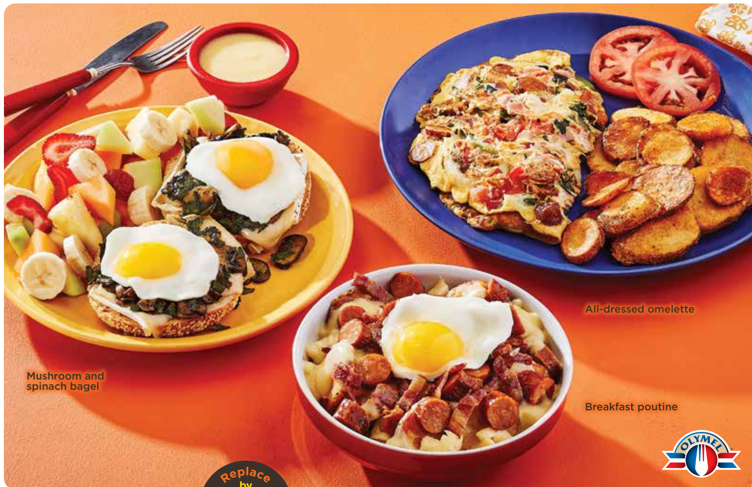
Mushroom and spinach bagel