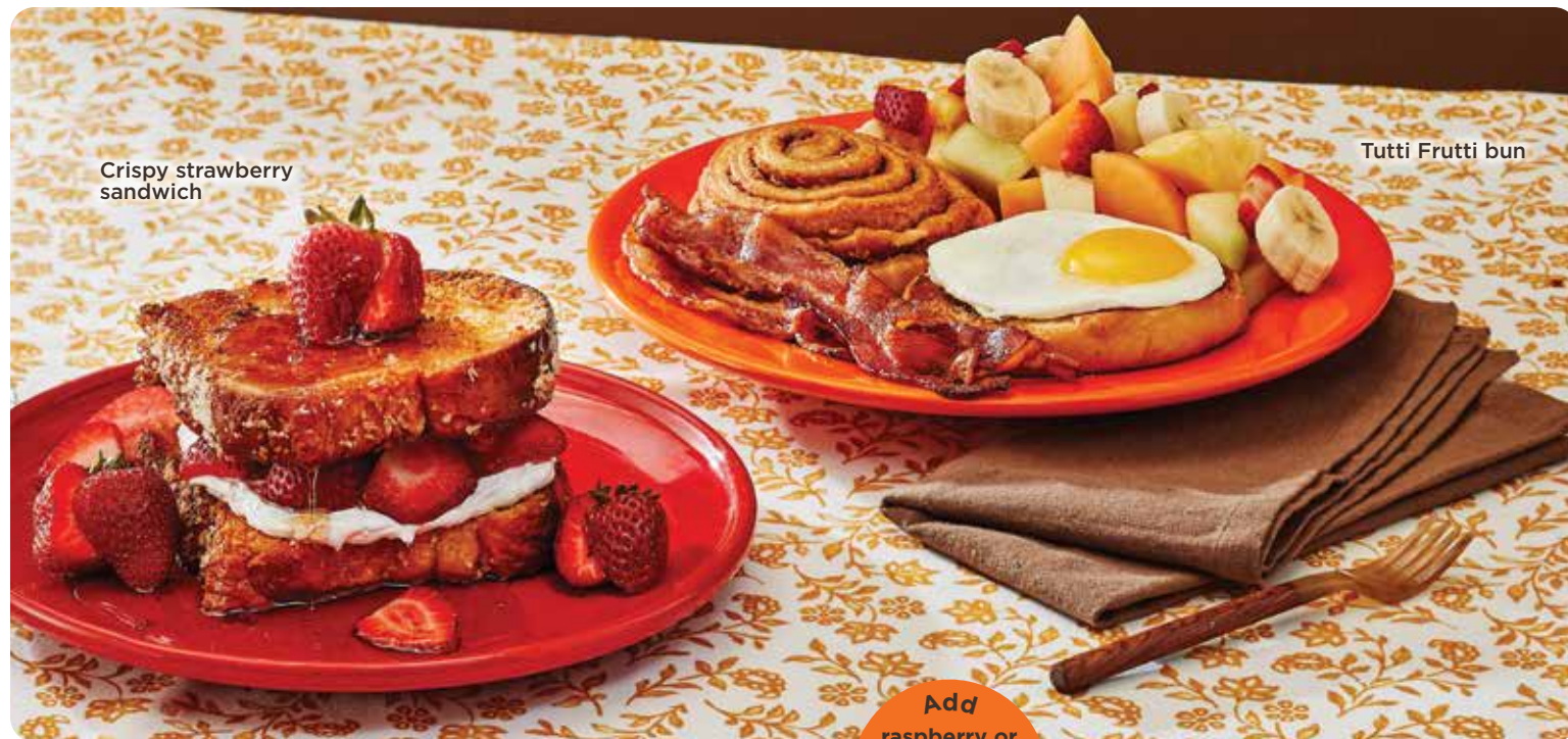
Crispy strawberry sandwich