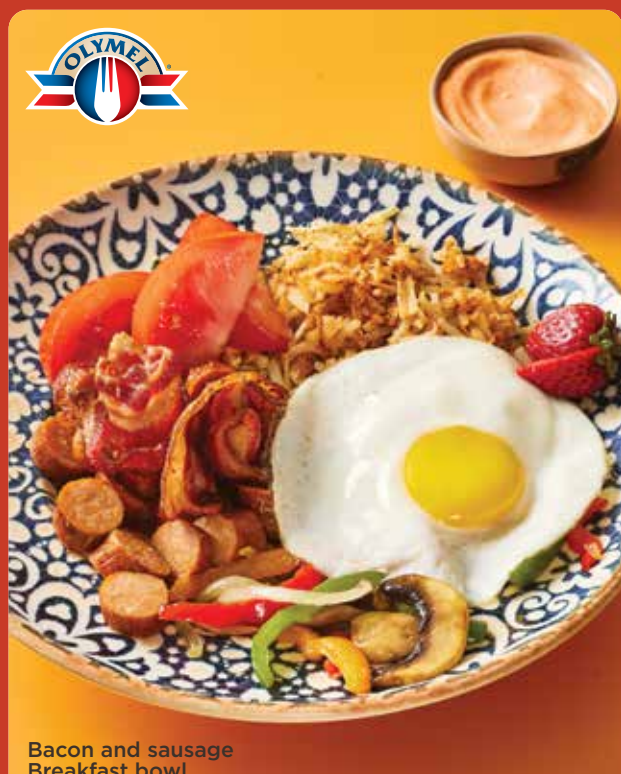
Bacon and sausage Breakfast bowl

Add a freshly squeezed orange juice $7.45