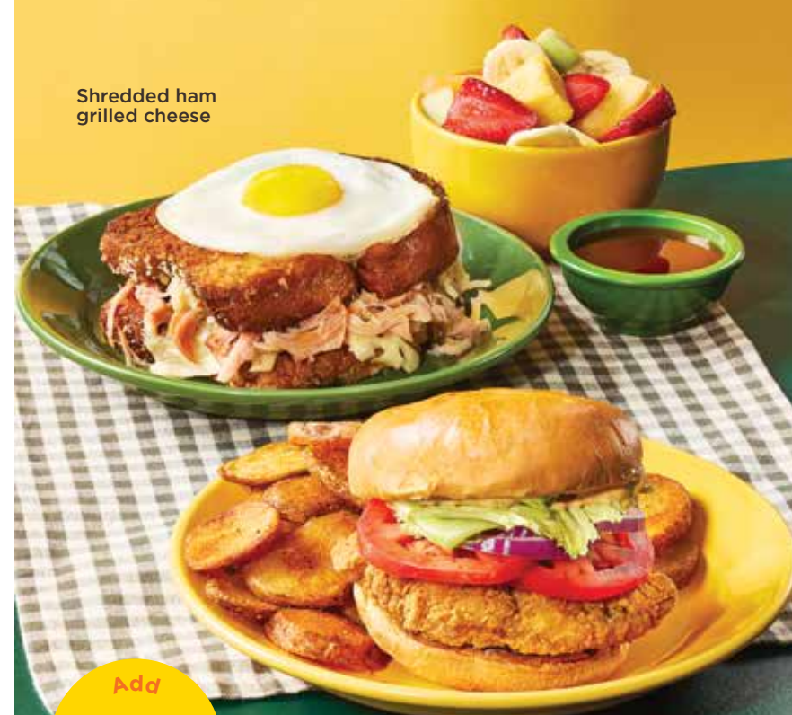
Crispy chicken burger