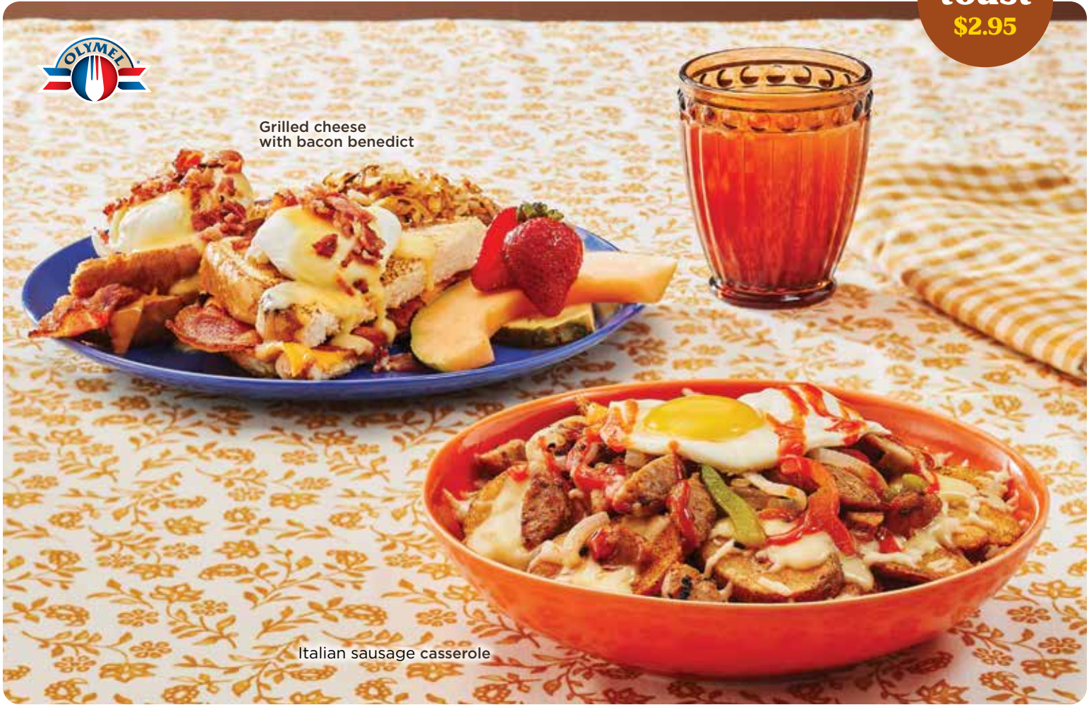
Grilled cheese with bacon benedict