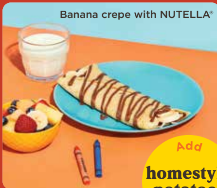
Banana crepe with NUTELLA®