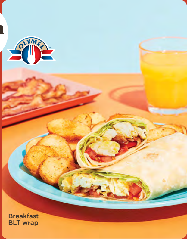
Breakfast BLT wrap

3 cheese omelette 10 25 Swiss, Cheddar and yellow cheese. Garnished with green onions and served with homestyle potatoes