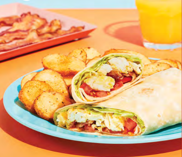
Breakfast BLT wrap

All dishes on the lunch menu are served with homestyle potatoes. Monday to Friday starting at 11:00 a.m., except holidays.