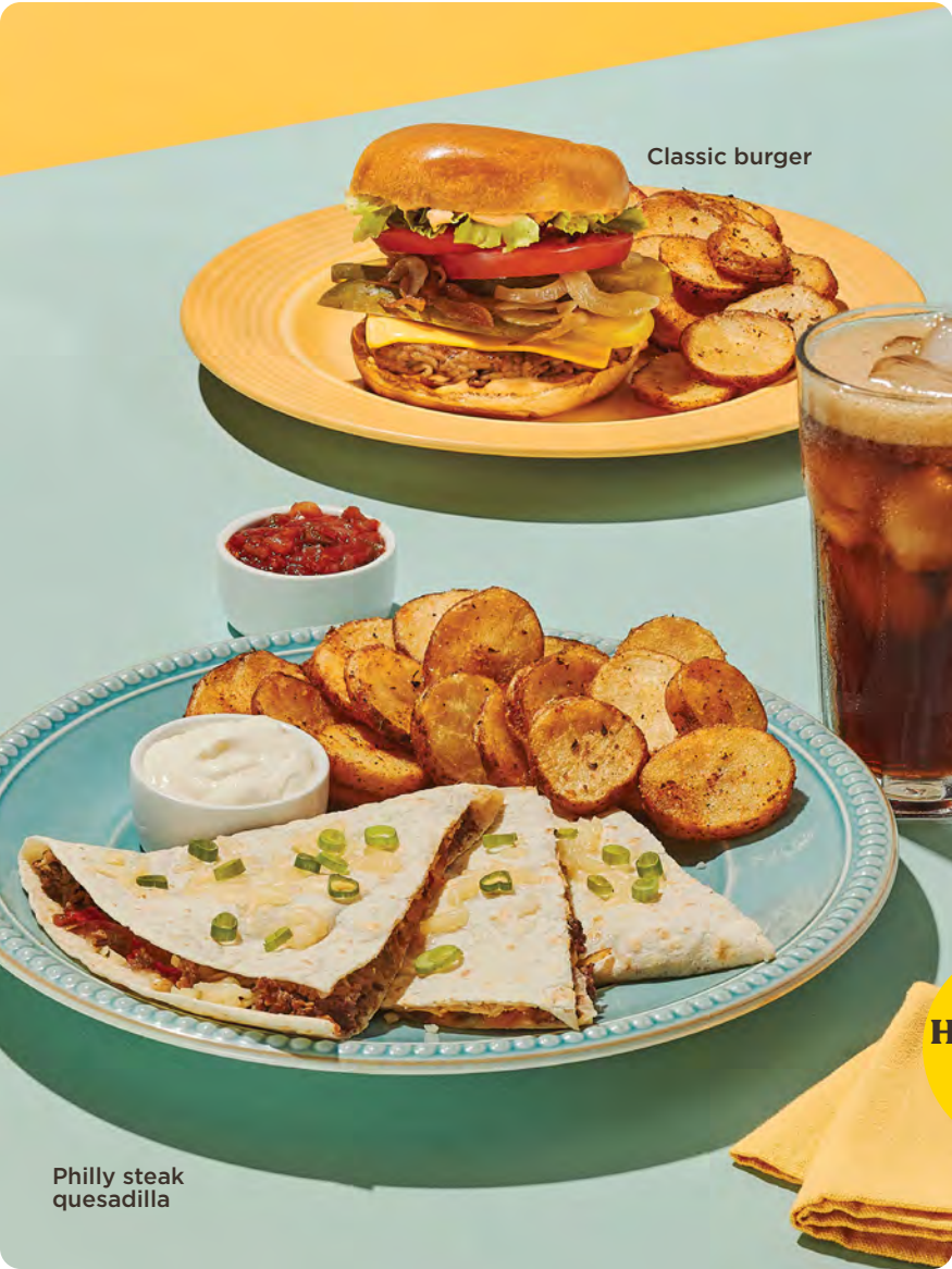
Philly steak quesadilla