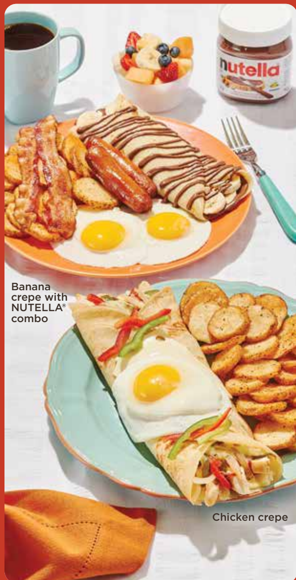
Banana crepe with NUTELLA® combo

Smoked salmon and capers N 20 95 Stuffed with smoked salmon, cream cheese and caramelized onions. Topped with egg, capers and served with Hollandaise sauce