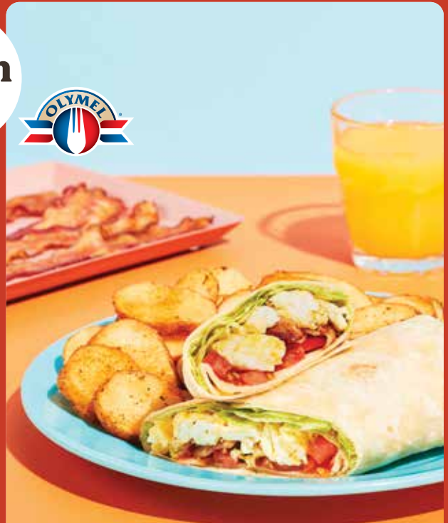
Breakfast BLT wrap