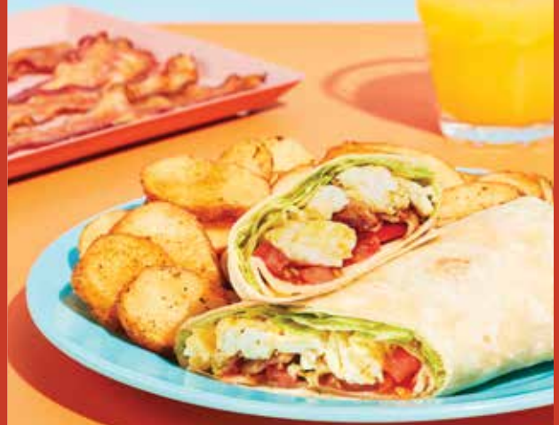
Breakfast BLT wrap