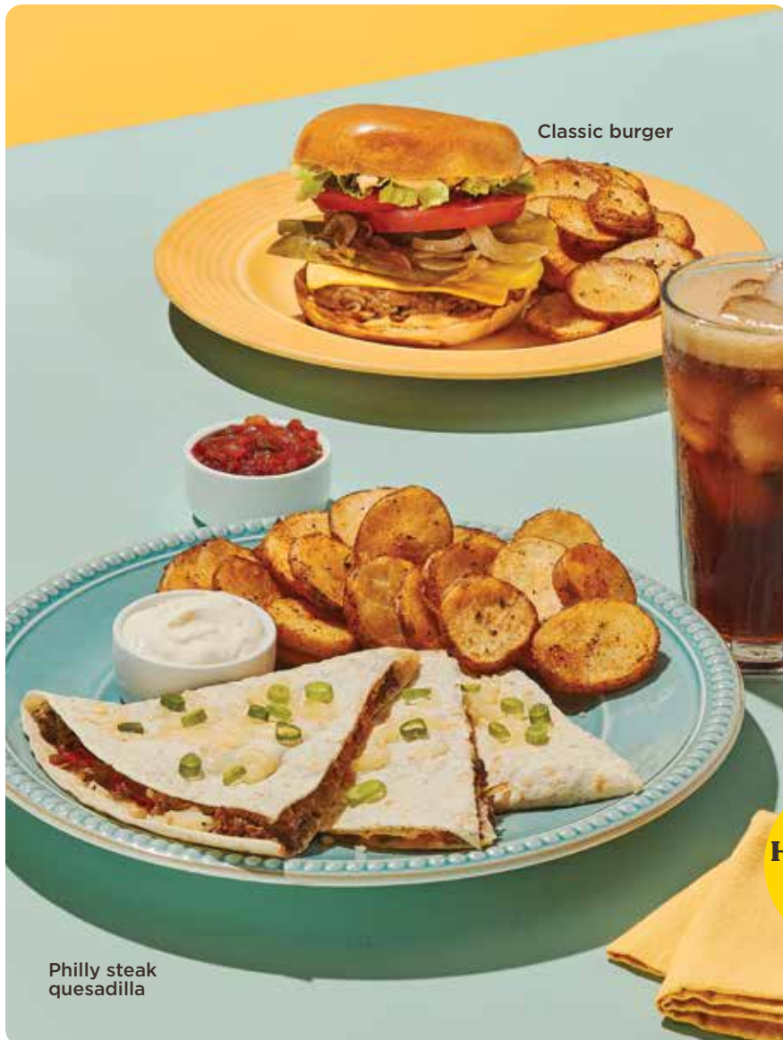
Philly steak quesadilla