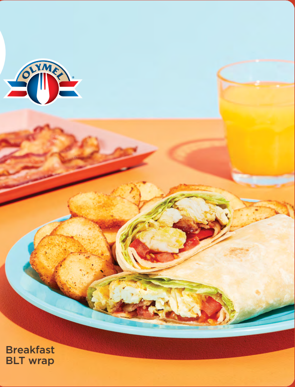
Breakfast BLT wrap

All dishes on the lunch menu are served with a choice of regular coffee or soft drink and are served with homestyle potatoes. Monday to Friday starting at 11:00 a.m., except holidays.