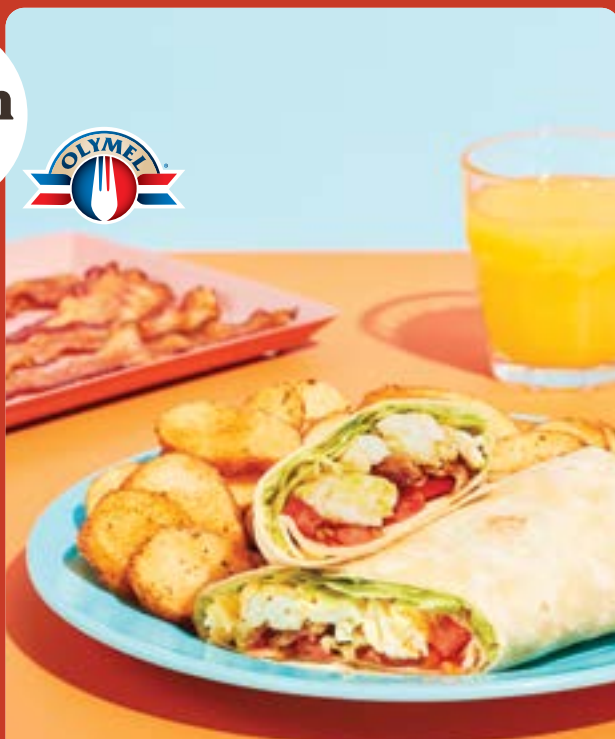
Breakfast BLT wrap