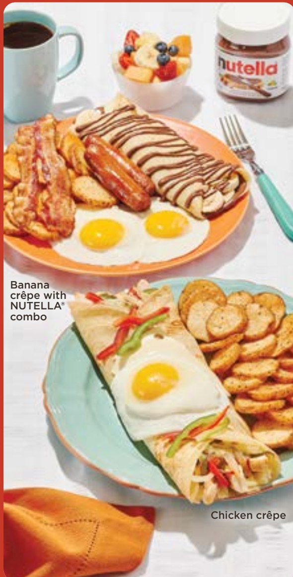
Banana crêpe with NUTELLA® combo

Smoked salmon and capers N 20 95 Stuffed with smoked salmon, cream cheese and caramelized onions. Topped with egg, capers and served with Hollandaise sauce