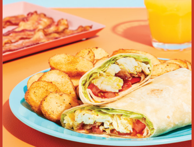
Breakfast BLT wrap