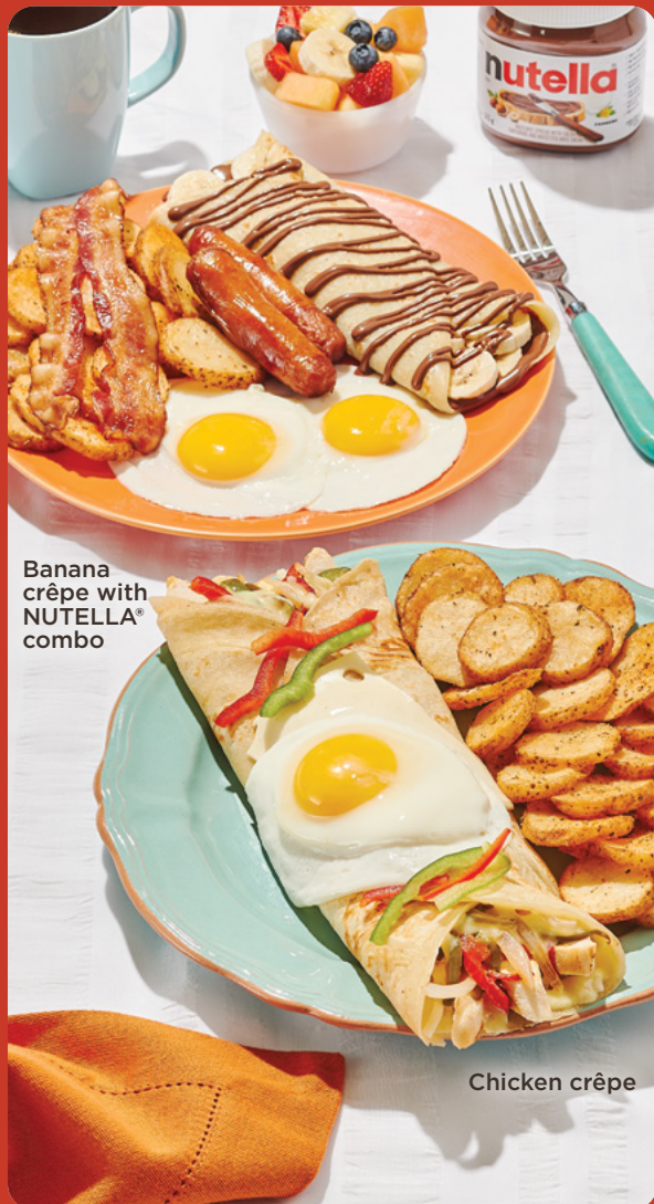
Banana crêpe with NUTELLA® combo

Smoked salmon and capers N 20 45 Stuffed with smoked salmon, cream cheese and caramelized onions. Topped with egg, capers and served with Hollandaise sauce