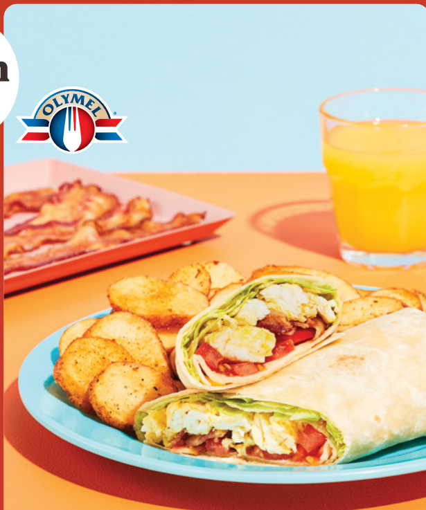
Breakfast BLT wrap