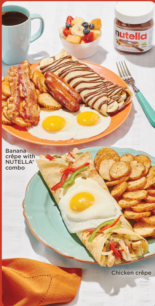
Banana crêpe with NUTELLA® combo

Smoked salmon and capers N 20 95 Stuffed with smoked salmon, cream cheese and caramelized onions. Topped with egg, capers and served with Hollandaise sauce